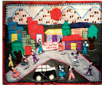
Peace Justice Freedom (0.4 x 0.5 m) by anon

78 Bishopsgate, London EC2N 4AG (Nearest underground station: Liverpool Street)