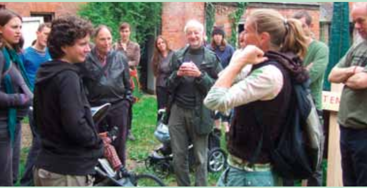
Campers being shown round the Crabapple Community

The first issue of Peace News was distributed on 6 June 1936, just over 75 years ago. Since then it has had a variety of affiliations, homes, editors and preoccupations, but its core purpose has remained the same: to serve those who work for peace and justice. Circulation reached a high point just before WWII, when we put out 35,000 copies a week. Even during the war, however, when we relied on volunteers to print and distribute the paper, PN had a circulation of 20,000. Today, in the age of the internet, Peace News faces new challenges and new opportunities, committed to promoting nonviolent revolution.