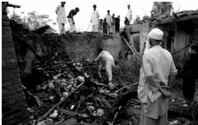
Afghans inspect a damaged house after a drone crash in Jalalabad, 21/08/11

So it comes as no surprise that Britain is now fully engaged with both cuts in defence spending and developing armed drones. As well as cancelling various contracts and plans, the British Army will be reduced from a total of 196,150 personnel in 2006 to just over half that amount now, and no more than 82,000 in 2020. At the same time, more drones are on order (we currently use the US-made Reaper and Predator drones), although if the MoD decides on the BAE Systems Mantis model, we can be assured they will come in over budget and delivered late - and probably not work very well. From having our drone pilots (39 Squadron) operating from Creech, Nevada and practicing on Israeli drones flying over Gaza, another squadron will operate from RAF Waddington near Lincoln, prompting the setting up of a peace camp at the base's gates ( see below ).