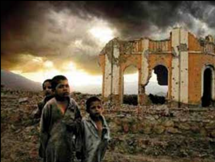
Afghanistan in ruins