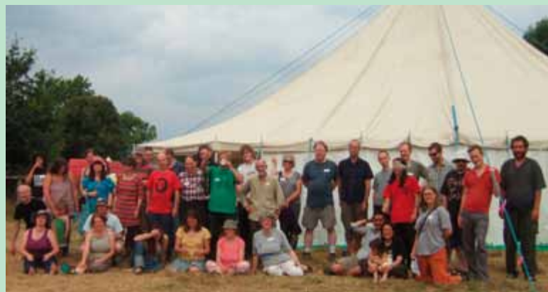
Some of the Peace Campers