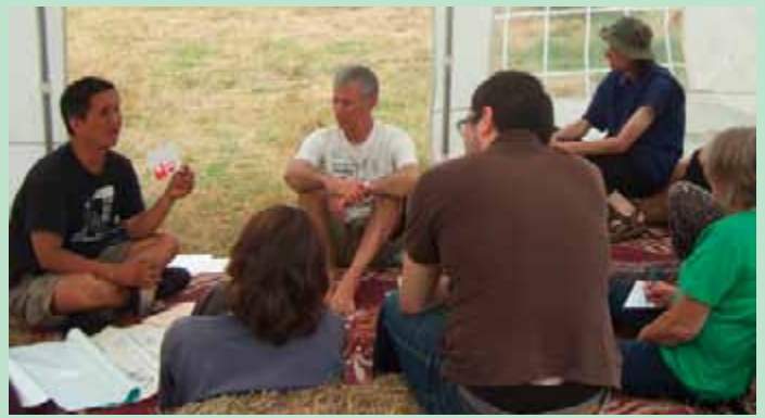
Mil talking about Noam Chomsky

In amongst all of this, the camp organisers had decided to lay stress on a theme: community organising for radical social change, with workshops involving the whole camp. We thought