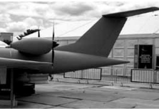
systems Mantis drone

Civilian Casualties of Armed Conflict says, under humanitarian law, all casualties should be recorded, identified and given a proper burial. How can that be done if you are fighting your war from half a world away? And developments will allow one operator to run up to five drones at a time. That will not make for accuracy. Nor will drones – also in the pipeline – that