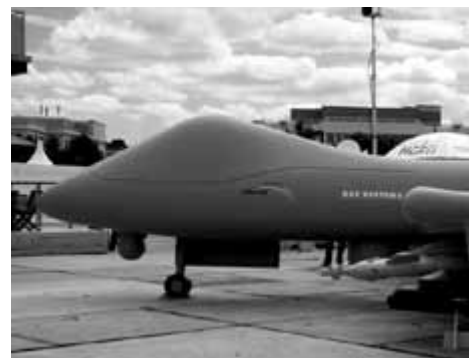
The BAE Sy

airport and airspace will draw commercial firms who are currently banned from testing their aircraft in the United States except in restricted military airspace. But general aviation pilots can still fly through the region, as well as Royal Air Force pilots who conduct training missions nearby. Given how many small private planes and helicopters also fill our skies,