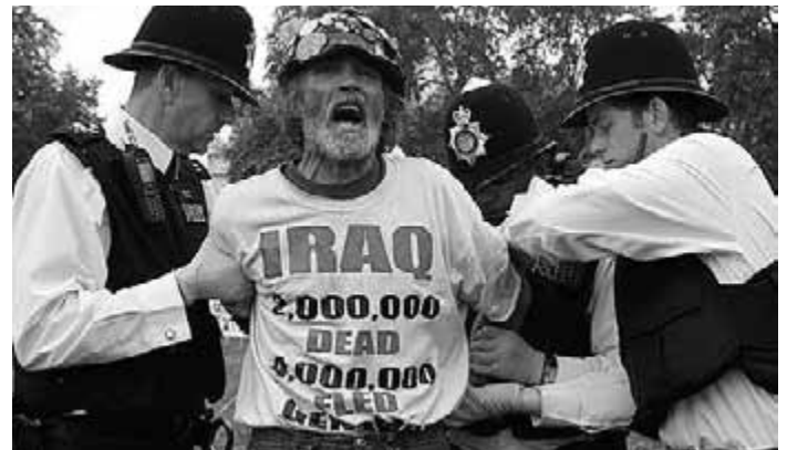
He didn't go home for tea

I loved him for his stubborn acceptance of the smears and violence to which he was subjected, his ability to fight back against all who dared to pretend he was, of all things, a traitor! Are the millions who marched also traitors, or was their treason the fact that they went home for tea?