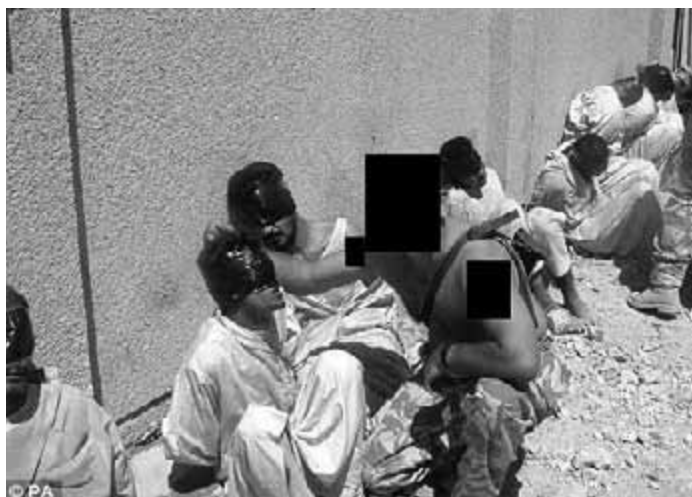
The bad side of war: British abuse of detainees

I wrote Disadvantage in 2003, after reading one of Robert Fisk's early reports from Iraq. The occupying US troops in Fallujah were trying in some places to make friends with the population and giving candy to the children, while a few streets away their comrades had lost their self-control, and were cursing, bullying and threatening. Their mission to 'win hearts and minds' amid a culture and people of which they had no understanding was proving incompatible with their training to be fighters and killers. In the days that followed Fallujah was to be the scene of atrocious and repeated bloodshed and destruction.