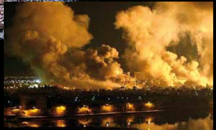
Baghdad - 'Shock and awe'