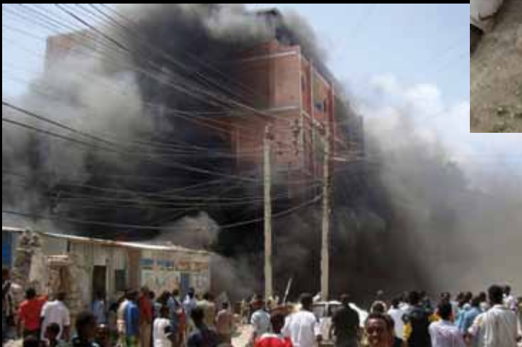
Somalia - drone strike on al Qaeda