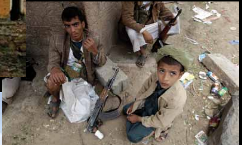
Fighters in Yemen