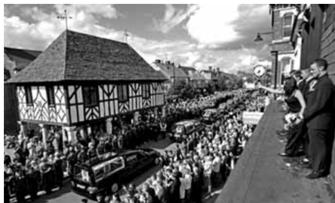
The sad side of war: coffins in Wootton Bassett

I wrote A vulnerable man about Norman Kember who was held hostage in Iraq while on a peace building mission. Many people seem to think that all you need to do is kill the bad guys to bring about peace and harmony. In fact, no side in a conflict is