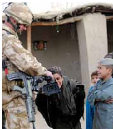
The better side of the 40 Commando Royal Marines' tour in Sangin Province, Afghanistan.

'If the 21 members of Combined Force Sangin 40 Commando Royal Marines, who died over the last six months, could speak to us now they would of course say many things: they would ask us to look after their grieving loved ones, they would ask us to look after their colleagues injured in body, mind or spirit, but they might also say: do everything you can to create a world where I would never have had to go to war; do everything you can to ensure that no one else has to endure the suffering that my loved ones are now enduring.' These words come from a Remembrance Day sermon delivered in Taunton last year by a forces chaplain (Norton Manor Camp outside Taunton is the home of 40 Commando Royal Marines). Fine words, you might think, butter no parsnips, but this particular chaplain, having served in Afghanistan and seen his friends die or be wounded and also observed their violence towards the 'enemy', is taking action to create peace and reconciliation between British and Afghan people. To read what he is doing, turn to page 10.