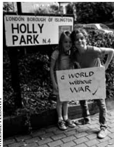
No culture of violence here!

The next stop was Elthorne Park and the Philip Noel Baker peace garden. Lord Noel Baker was a Quaker and a tireless campaigner for good relations between countries and an end to the arms race. Winner of the Nobel peace prize, he was also an Olympic silver medallist (1920 for 1500m) and believed in sport as a road to peace.