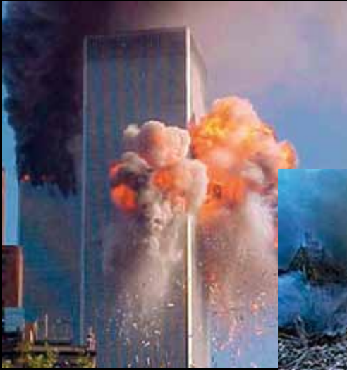
The Twin Towers under attack